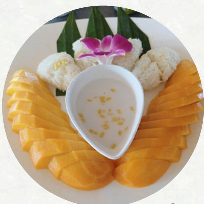
Mango & Sticky Rice