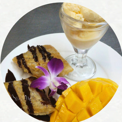
Roti Ice cream