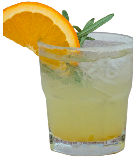
Margarita Yuzu • ฿ 420

Sparkling wine Japanese Yuzu Orange Juice