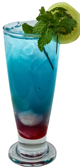
Sundown • ฿ 220

Grenadine Tequila Triple Sec Syrup Lime Ginger Ale