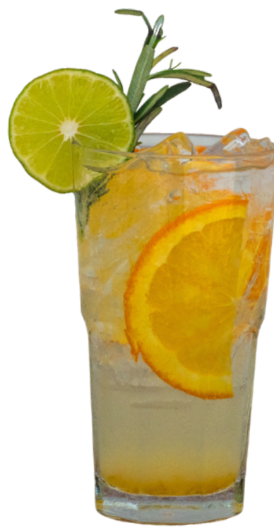
Yuzu Gin & Tonic • ฿ 380

Absolut Vodka Japanese Yuzu Orange juice Grenadine Peach Schnapps