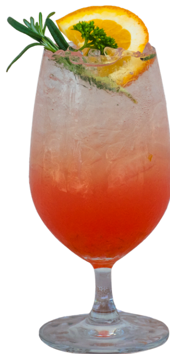
Sunshine • ฿ 300

Absolut Vodka Grenadine Blue Curacao Malee Blue Japanese Yuzu Syrup