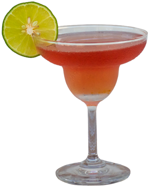
Cosmopolitan • ฿ 380

Absolut Vodka Japanese Yuzu Cranberry juice Syrup