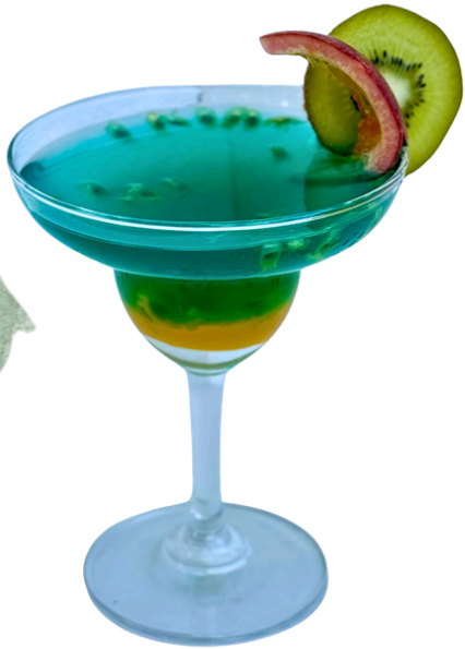
At Lanta • ฿ 220

Rum Blue Curacao Peach Passion Fruit Lime