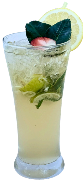
Tom Yum Cocktail • ฿ 220