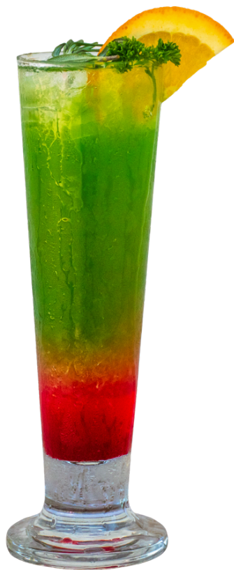
Long beach Paradise • ฿ 280

Absolut Vodka Coconut milk Blue Curacao Grenadine Japanese Yuzu