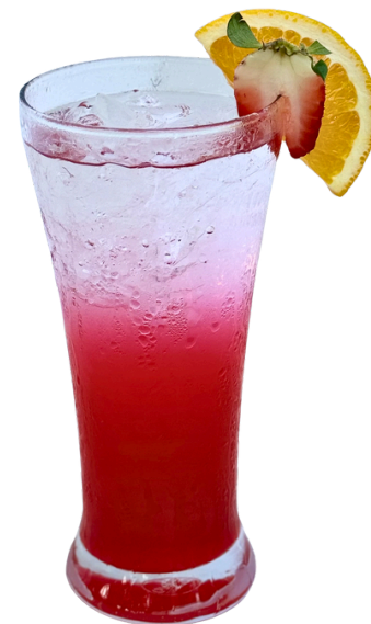
Red One • ฿ 220

Gin Blue Curacao Triple Sec Lime Grenadine Sprite