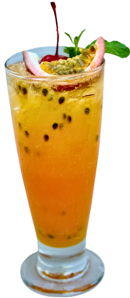
Sunset Escape • ฿ 220