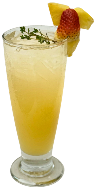
Love lanta • ฿ 220

Grenadine Tequila Triple Sec Syrup Lime Ginger Ale