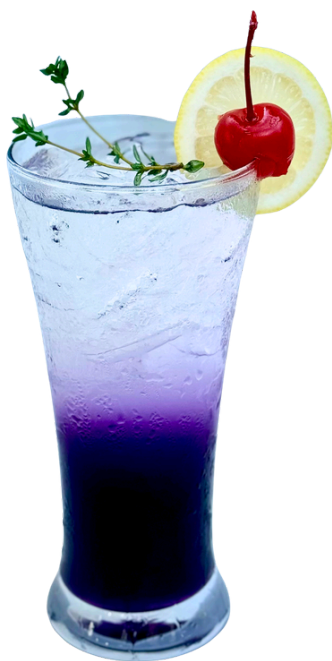
SLEEP - REPEAT • ฿ 220

Gin Blue Curacao Triple Sec Lime Grenadine Sprite