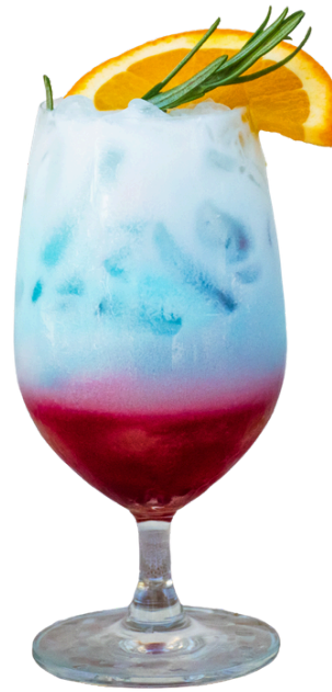
Freedom Colour • ฿ 250

Absolut Vodka Japanese Yuzu Cranberry juice Syrup