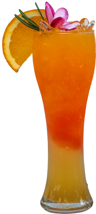
My kind of Summer • ฿ 260

Absolut Vodka Japanese Yuzu Orange juice Grenadine Peach Schnapps