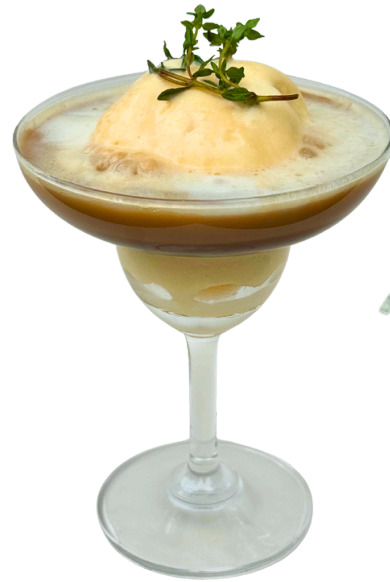
EAT- BEACH • ฿ 220

Rum Blue Curacao Peach Passion Fruit Lime