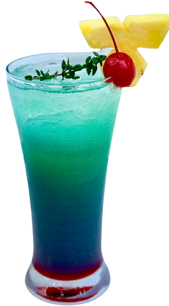
Long beach Sunrise • ฿ 220