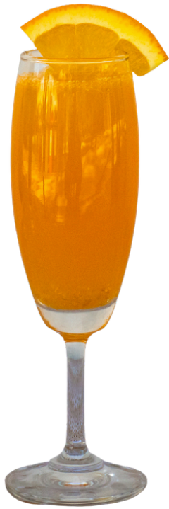
Mimosa Yuzu • ฿ 320

Sparkling wine Japanese Yuzu Orange Juice